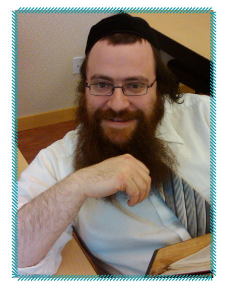
Owner of Frankel's 2011-